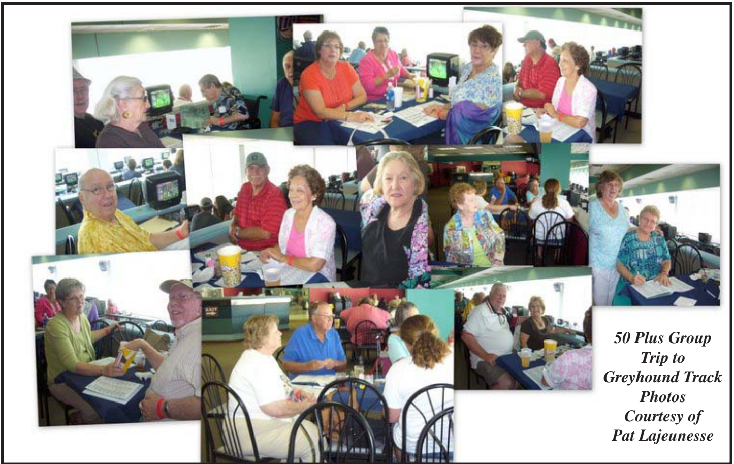
50 Plus Group Trip to Greyhound Track